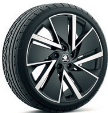
19" VEGA Aero black alloy wheels