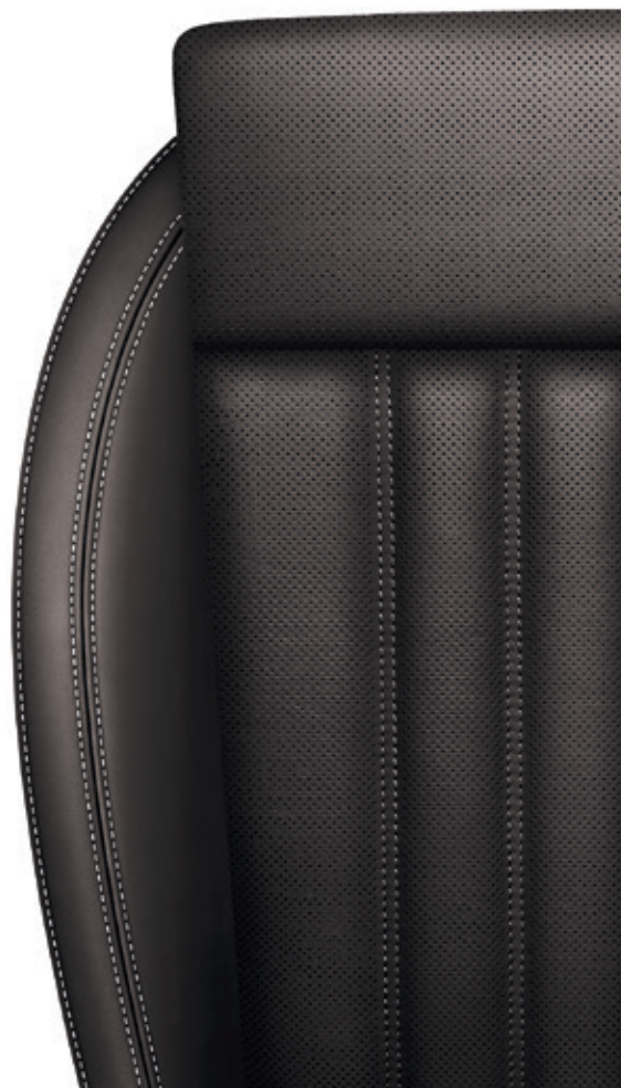
Laurin & Klement Brown (perforated leather/leatherette), ventilated front seats