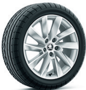
17" STRATOS alloy wheels