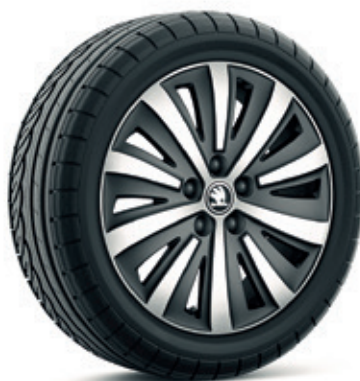
17" DRAKON alloy wheels