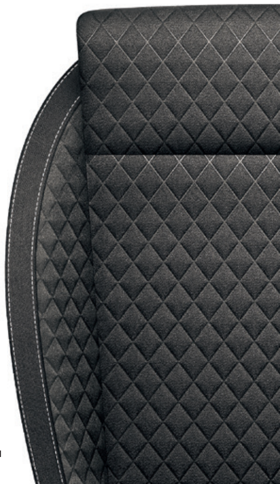
Ambition Black (fabric)