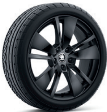
18" ZENITH black alloy wheels, polished*