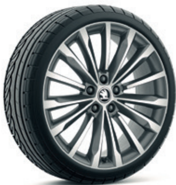
19" TRINITY anthracite alloy wheels