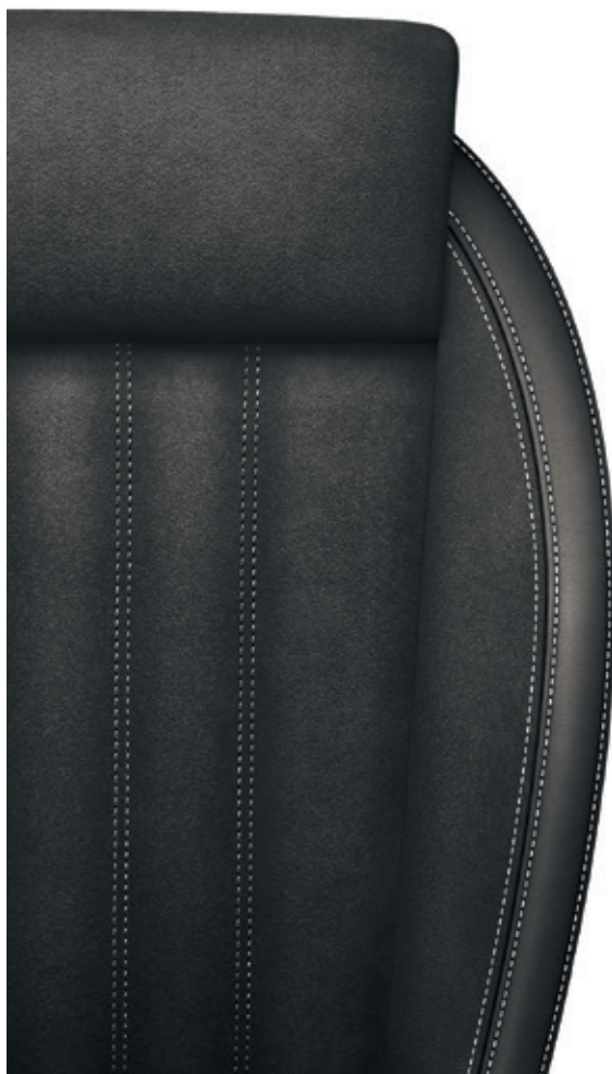
Ambition/Style Black (Alcantara®/leather/leatherette)