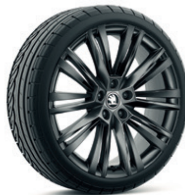
19" CANOPUS glossy black alloy wheels