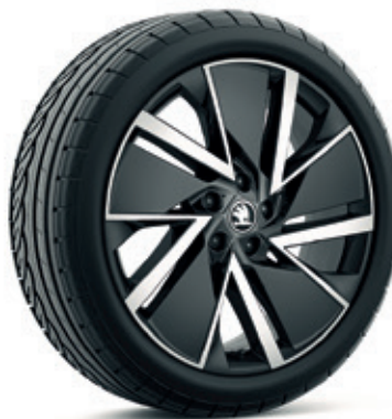
18" VELA black alloy wheels with aero covers**