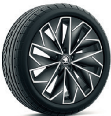
18" PROPUS Aero black alloy wheels