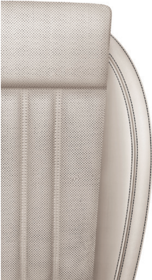
Style/Laurin & Klement Beige (perforated leather/leatherette), ventilated front seats