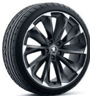
19" SUPERNOVA black alloy wheels*